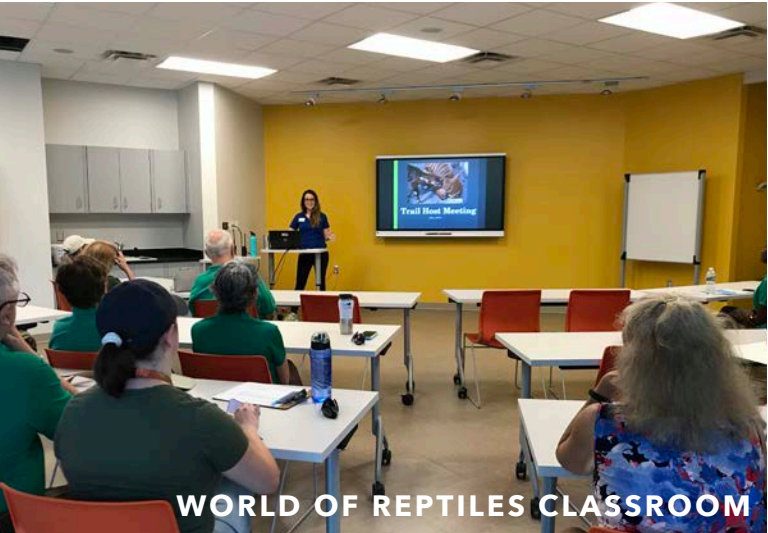
WORLD OF REPTILES CLASSROOM