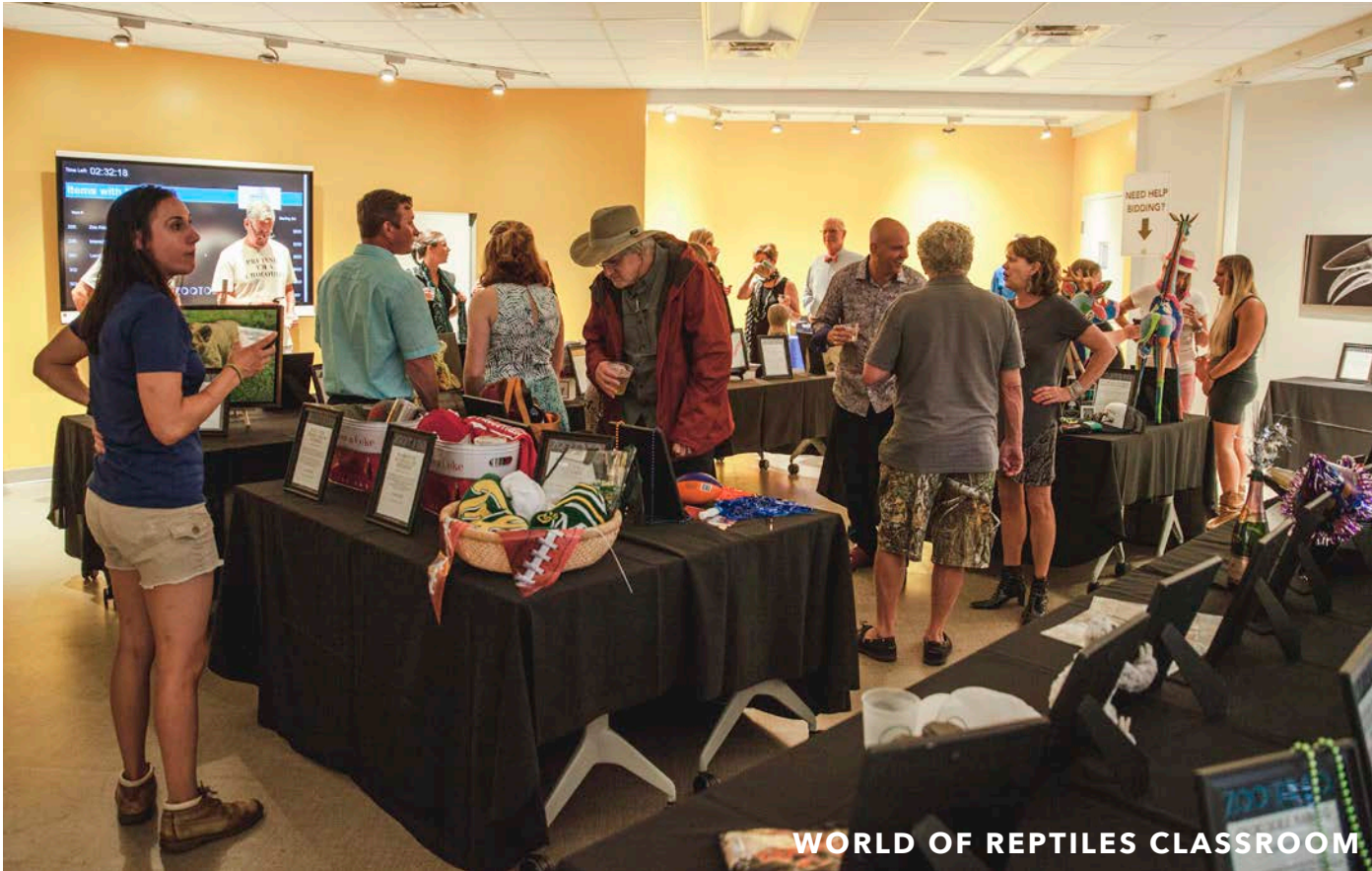
WORLD OF REPTILES CLASSROOM